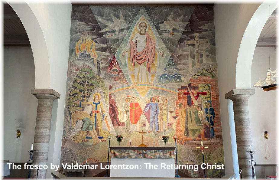
The fresco by Valdemar Lorentzon: The Returning Christ