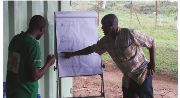
Adapting tools in Uganda

An important aspect of adaptation is also contextualising the language used in a tool. This can involve revising the language of questions to fit with local patterns of speech (e.g. colloquialisms), framing questions so that they match with contextually specific events, and conveying meaning of questions in easy-to-understand language.