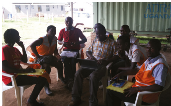
Group translation in Uganda

Questions that create confusion for participants should be reviewed for potential rewording to ensure that the concepts translate effectively in this particular community. The pre-test is a good time to remove and add questions based on feedback from the community. Questions or responses that may not be relevant or appropriate in this particular context may be considered for removal. However, this cannot be done when the item is from a previously validated measure, as it will invalidate the measure.