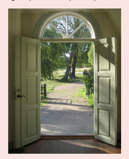
Welcome back to visit the chapel again!

An old gravestone in the abandoned churchyard: The triangle with God's all-seeing eye surrounded by the heavenly light, symbolised by the rays.