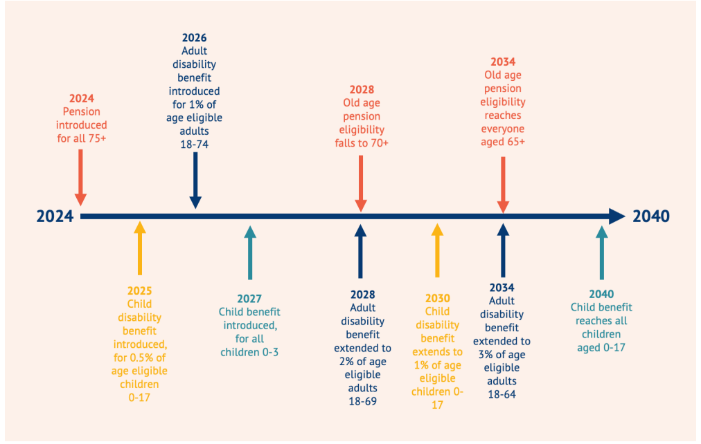
Figure 2: Diagrammatic representation of how the proposed universal social security system would expand over time 2026 Adult disability benefit

However, universal benefits can be both affordable and feasible when implemented through a gradual, phased approach. Initial costs can be as low as 0.1-0.4 per cent of GDP, expanding to 1.5-2 per cent of GDP over a period of two decades. Countries can start with limited coverage and expand over time, calibrating benefit levels to align with their fiscal capacity. For instance, Nepal introduced its universal pension in 1995 with an age threshold of 75 years, gradually lowering it to 68 years as the economy grew.<sup>10</sup>